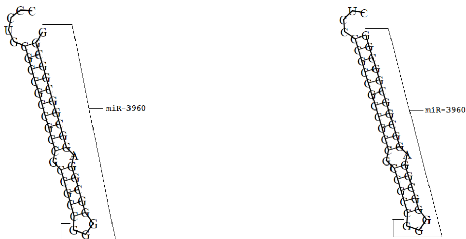
A - mir-3960 binding site in mRNA ABCC1 gene

It can be seen from the table 2 that the free energy of the interaction of the miR-3960 with mRNA of ABCC1 , ABCD3 , AFF2 , ANKH , ANKRD13D , BCL11A , BCL2L11 , BLMH , C4orf19 and CA10 genes are constituted more than - 108 kJ/mole with \Delta G/\Delta G_m values equal to 86 -91%. Among mRNA genes having nucleotide GCC repeats only ABCC1 and BLMH genes bind with high free energy - 116 kJ/mole with miR-3960. miR-3960 binding sites are located in region with GCC 7 and GCC 8 repeats between 31 (beginning of binding sites) – 57 and 182 (beginning of binding sites) – 211 nt (figure 2). The secondary structures given in the figure clearly show the preferential formation of bonds with miR-3960. The mRNA gene of ABCD3 interact with miR-3960 with full GCC 7 repeat. However, the binding sites of miR-3960 and mRNA genes of ANKH (GCC 5 ), ANKRD13D (GCC 4 ) and BCL11A (GCC 4 ) have only four and five GCC repeat.