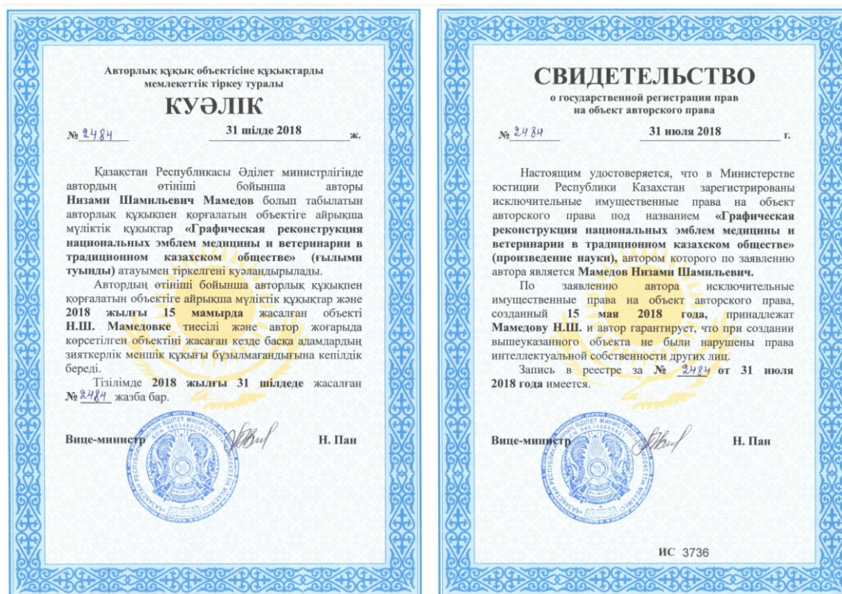
Picture 5 – Copy of certificate No. 2484 on state registration of rights to the object of copyright, dated on the 31 st July, 2018