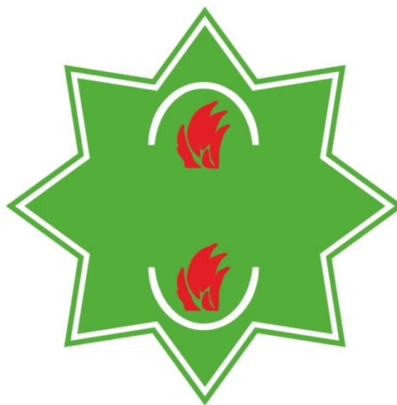
Picture 4 – Graphic reconstruction of the national emblems of veterinary medicine in the traditional Kazakh society

Description of the claimed designation in figure 3: the color pictorial sign consists of two main elements and is presented in the form of a fiery solar symbol - a genuine Kazakh eight – beam star of bright blue color, framed at the edges and perimeter by a narrow white strip. In the center of the eight-pointed star, two bright scarlet flames are located above each other and on one vertical line, each of which is framed by a white arc; according to the description, nomads, coming back from wintering, move with the cattle between the two fires, performing the rite of purification – alastau (synonymous with hygiene); bright blue color of the star is associated with tranquility and clear sky.