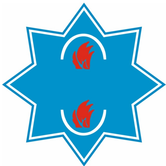
Picture 3 – Graphic reconstruction of the national emblems of medicine in the traditional Kazakh society

In 2018, we finally carried out a graphic reconstruction of the national emblems of medicine and veterinary medicine in the traditional Kazakh society (pictures 3, 4).