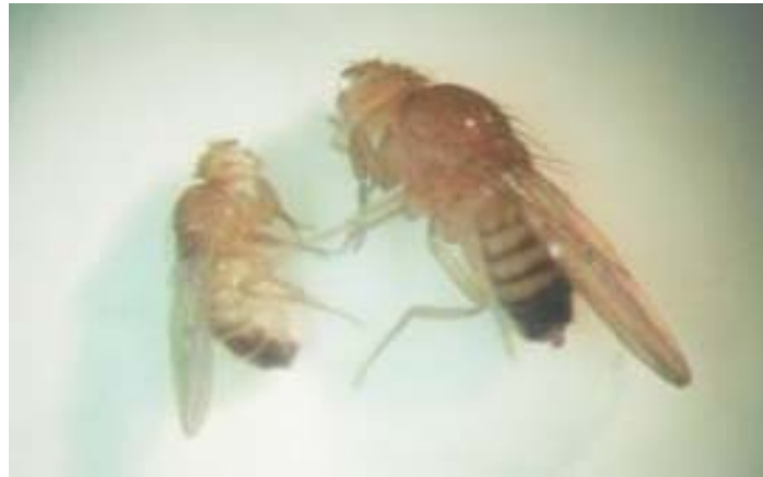
Figure 1 – Muller-5 line flies: on the left male (smaller) and female on the right

The recessive lethal cannot move from the irradiated chromosome to the Muller-5 chromosome, because of locking crossing-over between the irradiated normal chromosome and the Muller-5 chromosome. This makes it possible to bring the irradiated chromosome to a hemizygous state [11].