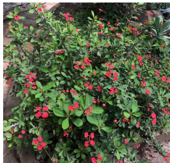
Figure 2 – Eu. milii var. splendens (Bojer ex Hook.) Ursch & Leandri

Euphorbia pulcherrima Willd. ex Klotzsch. Habitat: Tropical Mexico and Central America. In the wild, it is a shrub up to 2.5-3 m high. The leaves are 10 to 15 cm long, ovoid-elliptical with a pointed top, on long reddish cuttings. At the ends of the annual sprouts, there appear complex umbellate inflorescences with small, inconspicuous flowers surrounded by bright bracts of red, white, or yellow color. In our conditions, it blooms without seeding. It spreads easily, by vegetative propagation only (figure 3).