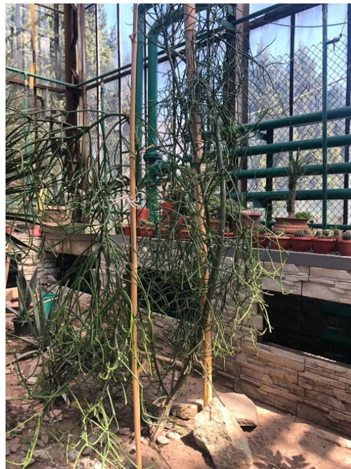
Figure 4 – Euphorbia tirucalli L.

Euphorbia obesa Hook. f. Habitat: RSA (Cape Province). It looks similar to Astrofhytum asterias (Zucc.) Lem. However, its body is slightly elongated, and it grows slower. A dioecious succulent-stem perennial with spherical or hemispherical non-branching leaves. The plant is gray-green, with transverse stripes, has 8-10 very flat ribs. With age, lateral sprouts are formed at the base. It does not bloom in our conditions but sometimes produces pups (figure 5).