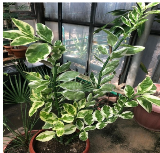
Figure 6 – Euphorbia (Pedilanthus) tithymaloides 'Variegata' L.