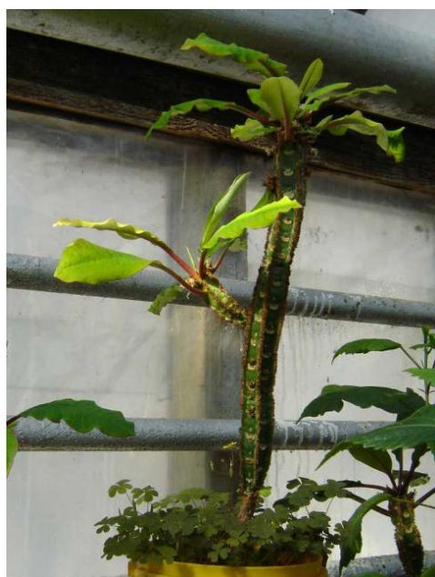
Figure 1 – Euphorbia leuconeura Boiss