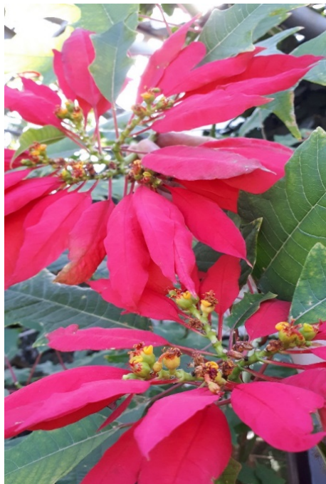
Figure 3 – Euphorbia pulcherrima Willd.ex Klotzsch

Euphorbia tirucalli L. Habitat: Tropical and subtropical areas of Africa, Asia, Arabian Peninsula, Madagascar, and India. Succulent-stem shrub up to 4 m or a tree up to 12 m tall, with smooth cylindrical bunched branches with falling leaves. It grows along the banks of small rivers, forming groves in bright forests at high altitudes. Propagates by cuttings (figure 4).